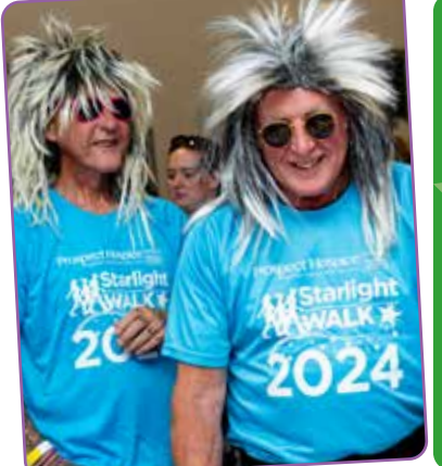
£160,000 the biggest total ever raised